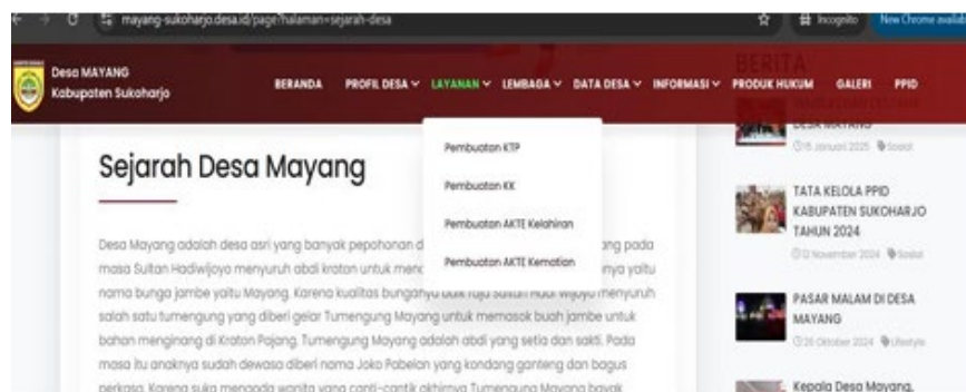
Figure 6. village History