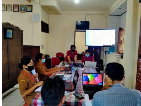
Figure 2 Training Microsoft Office

Figure 2 shows participants engaged in Microsoft Office training sessions, where they practiced basic document processing, spreadsheets, and presentations relevant to daily village administration.