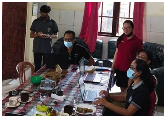
Figure 3. community internet training

Figure 2 shows participants engaged in Microsoft Office training sessions, where they practiced basic document processing, spreadsheets, and presentations relevant to daily village administration.