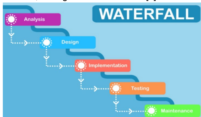
Figure 1. Waterfall Method

The SDLC (Software Development Life Cycle) method is the process of creating and changing systems as well as the models and methodologies used to develop software engineering systems [17]. The method used to create a website is the waterfall method. The waterfall method is a linear and sequential software development approach, where each phase (such as requirements analysis, design, implementation, testing, and maintenance) must be completed before the next phase begins. This method resembles a waterfall, flowing from top to bottom sequentially. The waterfall method consists of several stages, namely requirements analysis, design, implementation, testing and maintenance. [3]