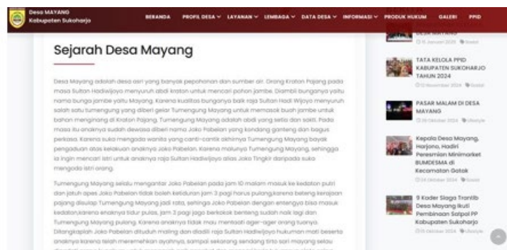
Figure 5. village profile

Figure 5 illustrates the profile page, which includes historical information, organizational structure, and the village's vision and mission.