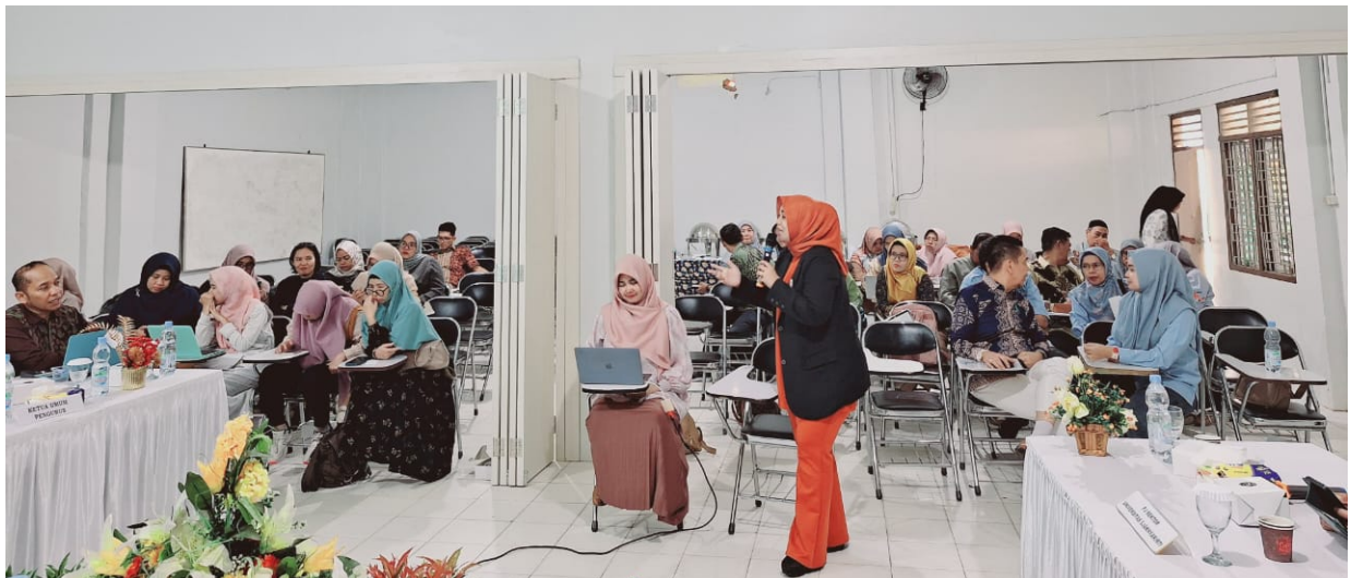
Figure 3. Interaction Speakers and Participants

Opening activity System Digitalization Training Administration at Sjakhyakirti Vocational School took place in the school hall in the morning day . Activities This started with remarks by the Head Schools that emphasize importance mastery technology information in support efficiency administration education . Participate present in opening This is team implementer devotion , teachers, and administrative staff school . Atmosphere opening ongoing with enthusiastic and full spirit , mark the beginning series training that will be implemented in a way interactive and applicable .