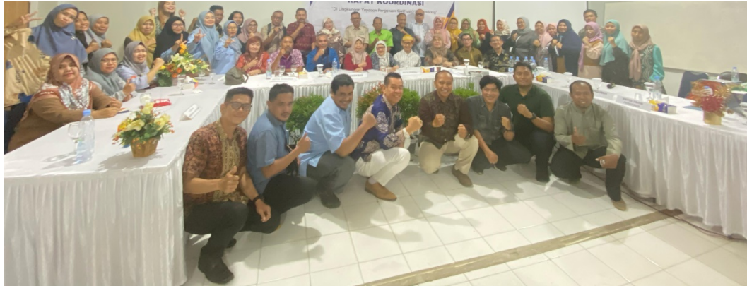
Figure 2. Opening Activity

Opening activity System Digitalization Training Administration at Sjakhyakirti Vocational School took place in the school hall in the morning day . Activities This started with remarks by the Head Schools that emphasize importance mastery technology information in support efficiency administration education . Participate present in opening This is team implementer devotion , teachers, and administrative staff school . Atmosphere opening ongoing with enthusiastic and full spirit , mark the beginning series training that will be implemented in a way interactive and applicable .